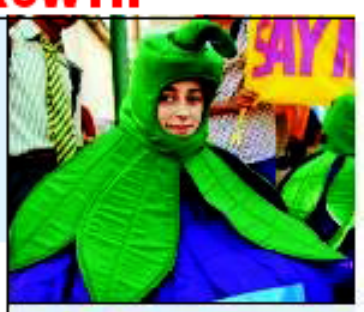
health. But they agree that giving a nod to commercial production can lead to monopolistic control of seed business by MNCs

Indigenous transgenic varieties include a high salttolerantrice which cangrow